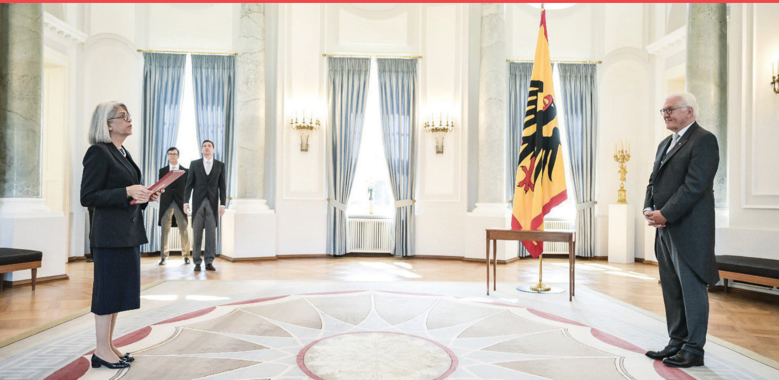
Accreditation of the new Ambassador of the UAE to Germany, H.E. Hafsa Al Ulama

جمعية المداقة الإماراتية الألمانية EMIRATI GERMAN FRIENDSHIP SOCIETY EMIRATISCH-DEUTSCHE FREUNDSCHAFTSGESELLSCHAFT