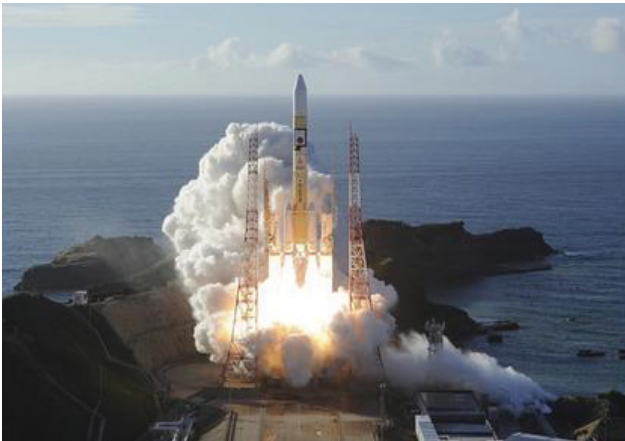
First Arabian rocket launch to mars