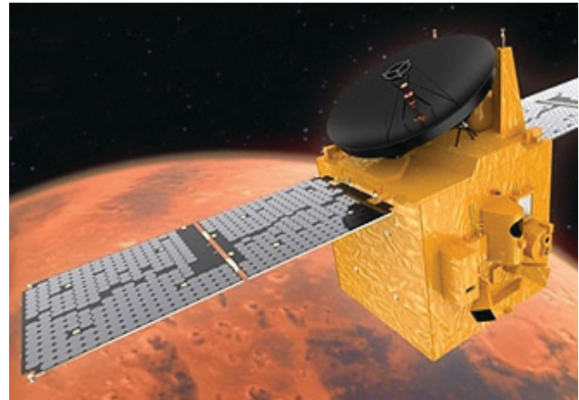
Satellite "Al Amal"

At midnight of 19 th June 2020, the United Arab Emirates sent a satellite called "Al Amal" into space. Al Amal, Arabic for "hope", is on its way to Mars. It is the first interplanetary mission of the UAE and is expected to enter into an elliptical orbit in February to observe the weather on Mars. The Emirati researchers are interested in weather changes during the course of the day as well as the seasons. In addition, Al Amal will send high-resolution images of the surface of Mars back to earth.