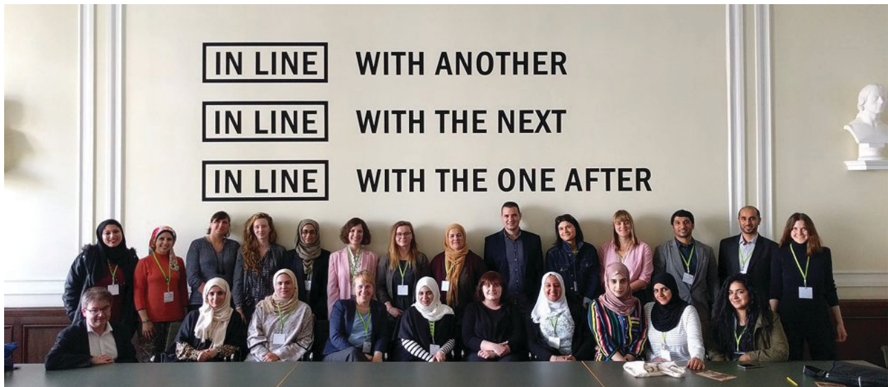
SAWA Museum Academy

The United Arab Emirates and Germany maintain strong diplomatic relations, which were intensified after the two countries signed a joint declaration of intent on the occasion of the visit of H.E. Crown Prince Mohammed bin Zayed to Berlin in June 2019.