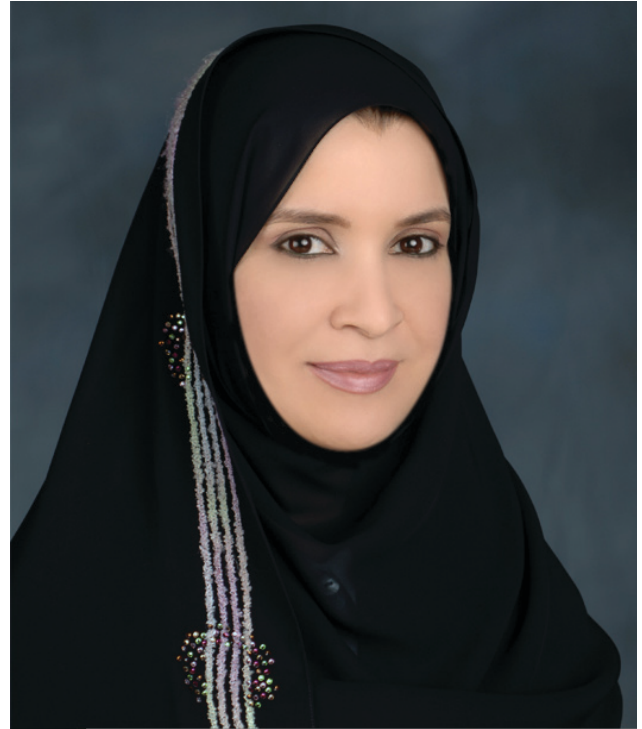
H.H. Sheikha Fatima bint Mubarak Al Ketbi

H.H. Sheikha Fatima bint Mubarak Al Ketbi launched the Emirati Women's Day in 2015 to recognise the crucial role of women in the country. The annual celebrations coincide with the founding of the General Women's Union in 1975. In 2017, H.H. Sheikha Fatima was honoured by UN Women, a United Nations entity working for the empowerment of women as a global champion of gender equality.