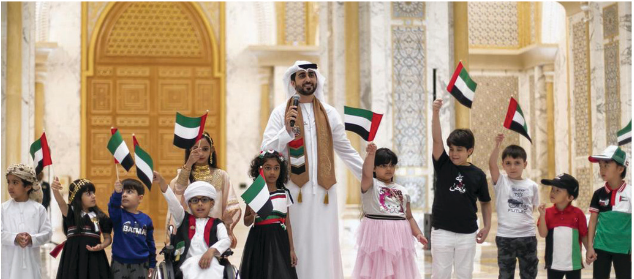
National anniversary 2019

In 2021, the UAE will celebrate its 50 th anniversary. In light of this, H.H. Khalifa bin Zayed bin Sultan Al Nahyan, President of the United Arab Emirates and Emir of Abu Dhabi, and H.H. Sheikh Mohammed bin Rashid Al Maktoum, Vice President and Prime Minister of the UAE and Emir of Dubai, have announced that their future efforts will focus on the expansion of the knowledge economy in order to detach the country from the fossil fuel industry.