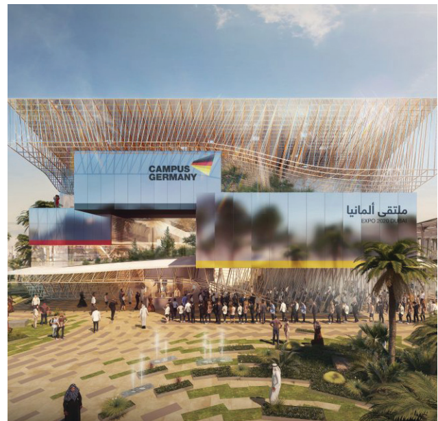
The German Pavilion (CAMPUS GERMANY)

Therefore the goal of 25m visitors still applies. The minister further mentioned the preparedness of the UAE to host a world-class event whatever size and whether the audience is