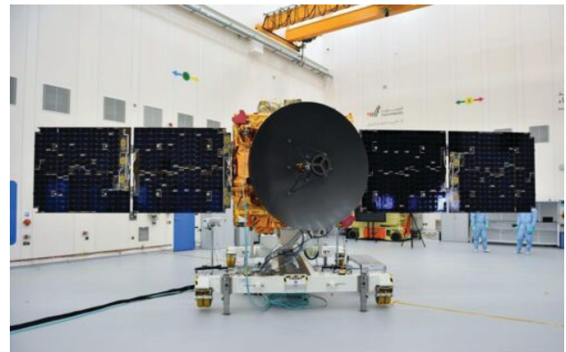
Laboatory of Prope Secifications