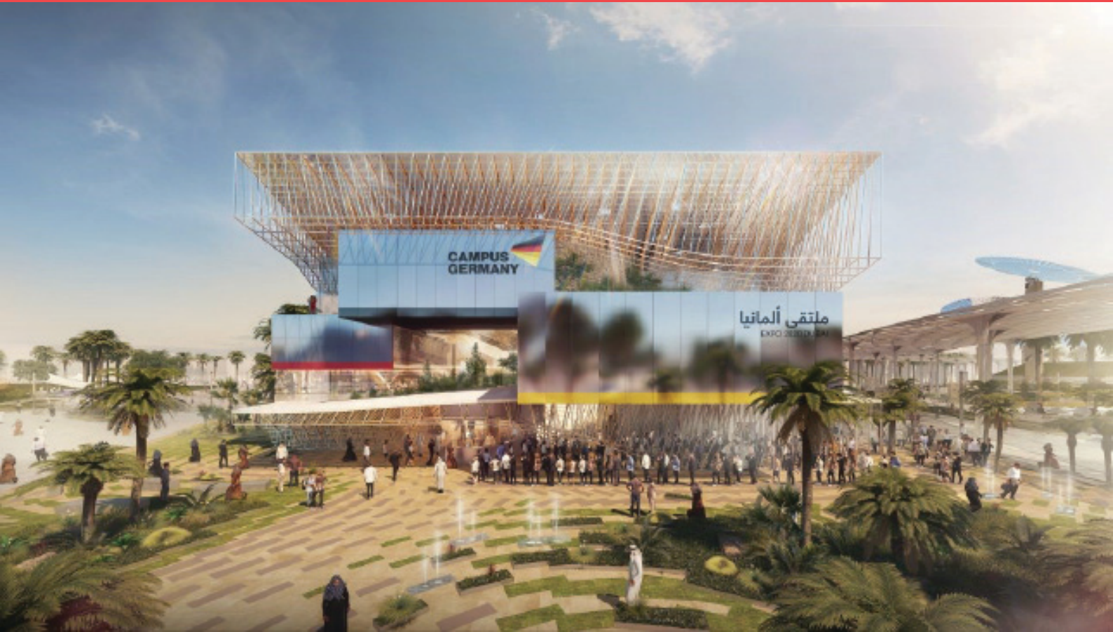
German Pavilion at Dubai Expo 2020

جمعية المداقة الإماراتية الألمانية EMIRATI GERMAN FRIENDSHIP SOCIETY EMIRATISCH-DEUTSCHE FREUNDSCHAFTSGESELLSCHAFT