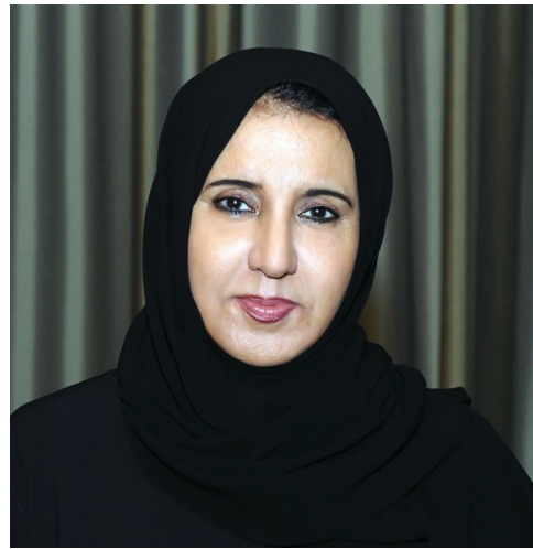
Sheikha Fatima bint Mubarak

leads the MENA region in women's empowerment, particularly given the recent legislations that offered women more rights and better protection,» said UN Women in a statement issued to the Emirates News Agency (WAM) on International Women's Day.