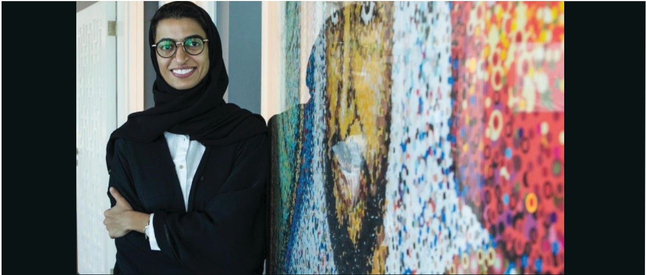
Noura al-Kaabi

UAE's art scene was indeed affected by Covid-19 but that did not yield an artistic standstill at all. Quite the opposite was the case: new technologies were incorporated and will leave an impact on modern arts even after the pandemic, H.E. Noura al-Kaabi, UAE's Minister of Culture and Youth, predicts.