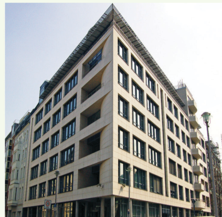
Kronenstraße 1, 10117 Berlin